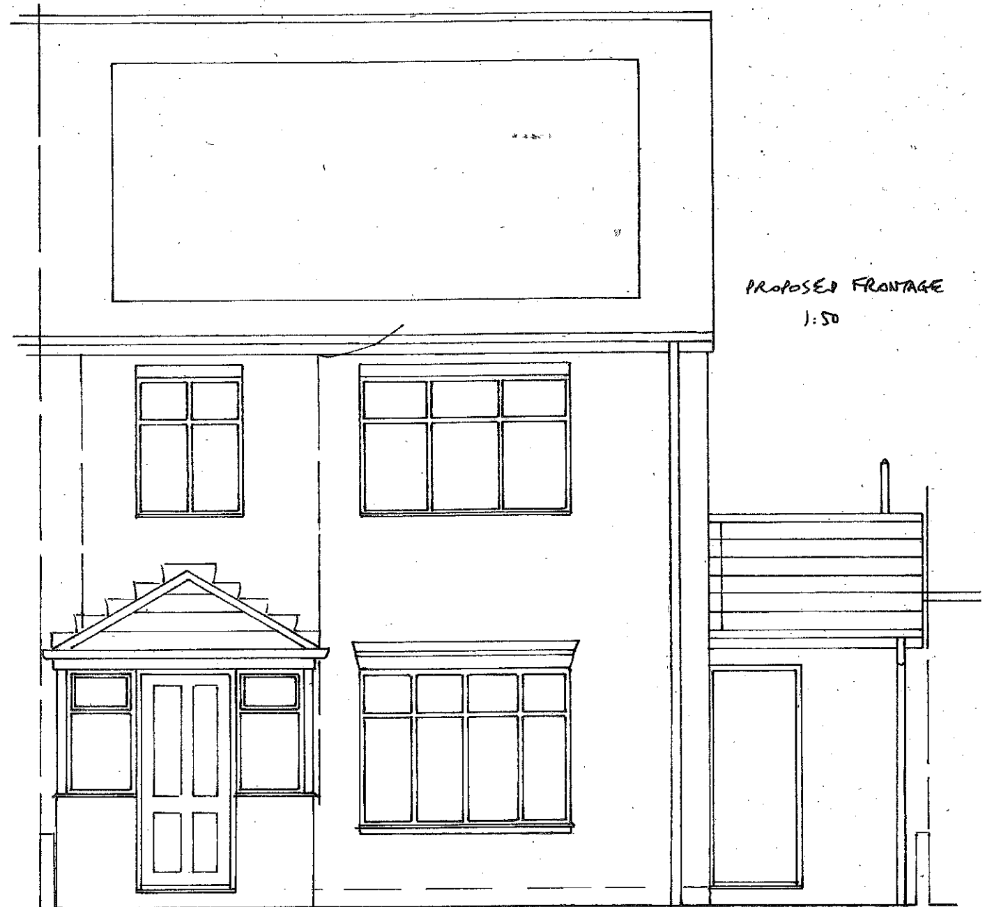
PROPOSED FRONTAGE 1:50

ROOF TILE, FACING BRICK, JAMB FRAMES, ETC. TO MATCH EXISTING AS CLOSELY AS POSSIBLE.